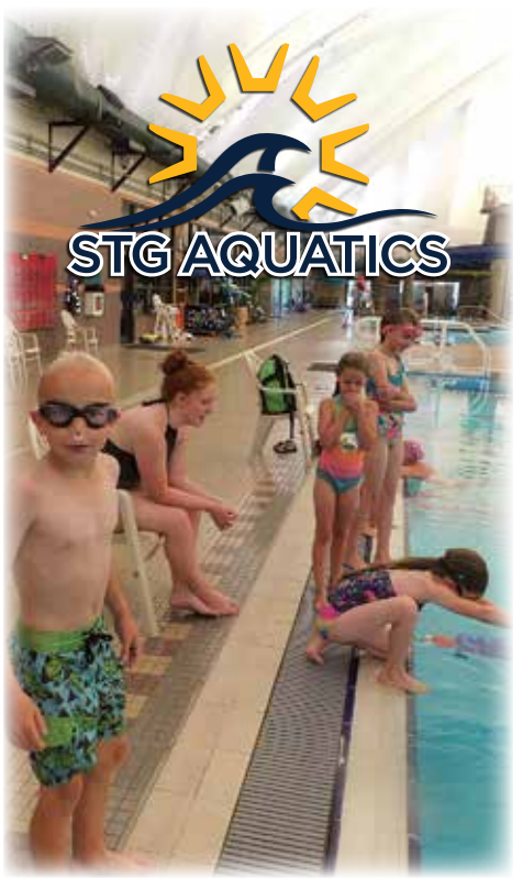
*Prices subject to change July 1, 2024

Description: This program offers participants an opportunity to learn the fundamentals of kayaking, canoeing, skimboarding, and paddleboarding. Throughout the week, participants will venture to different locations, discovering various bodies of water while engaging in group activities and play. All necessary equipment will be provided for the sessions.